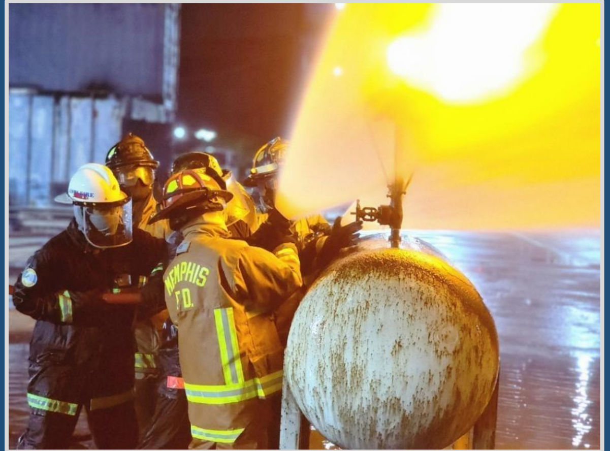
Advanced Firefighting Program