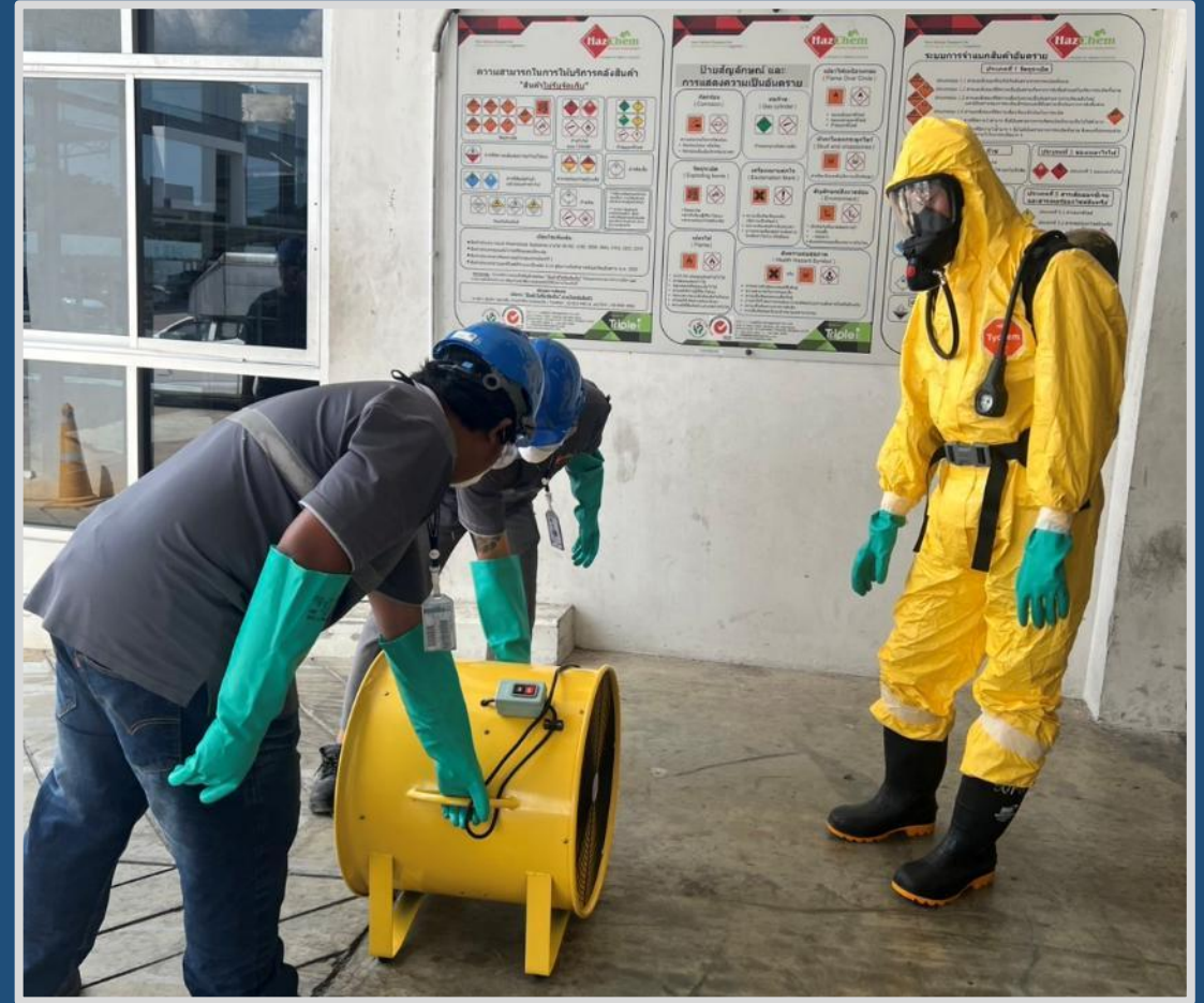
Annual Warehouse Emergency Response Plan for Chemical Spill Program