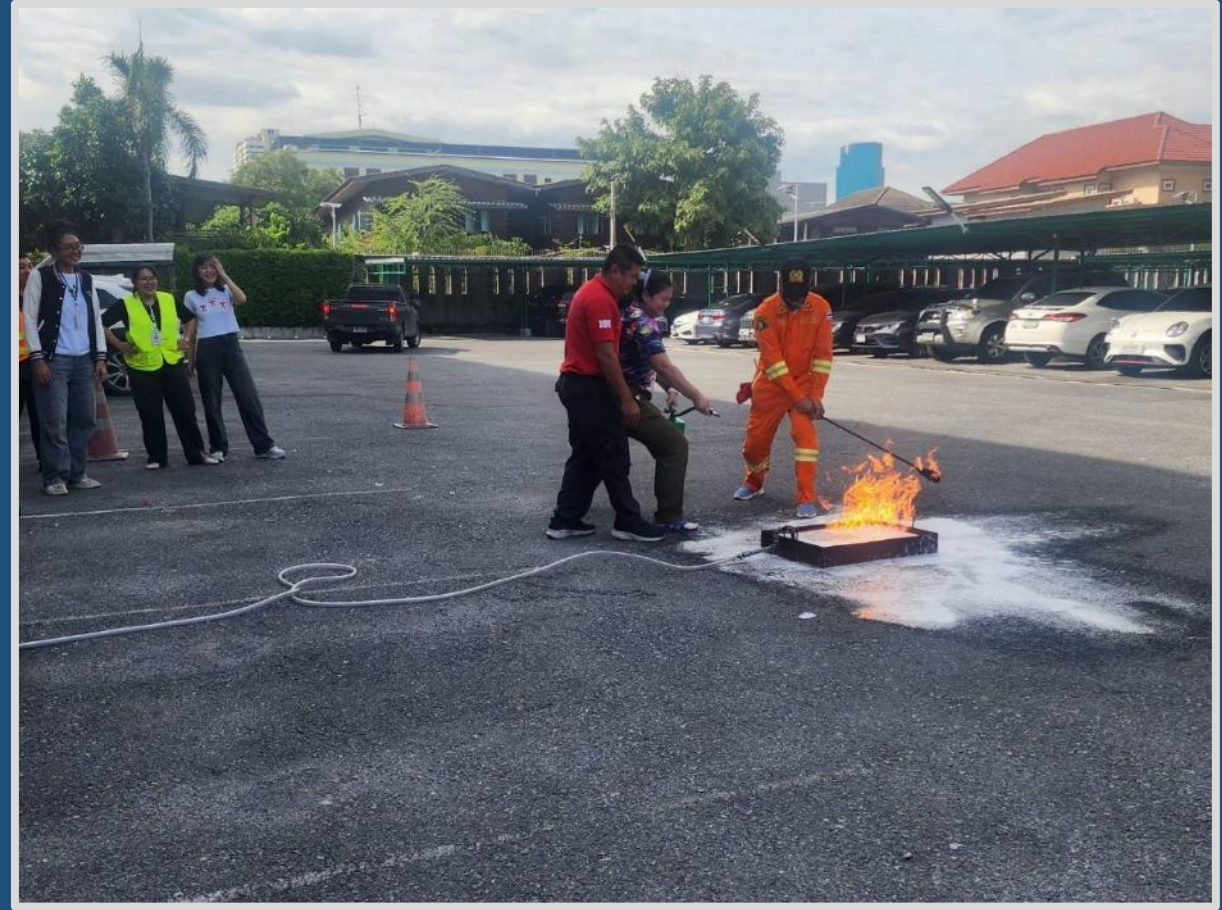
Basic Firefighting and Fire Evacuation Drill Program